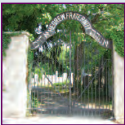
Hebrew Fraternity Cemetery in Hopelawn, NJ